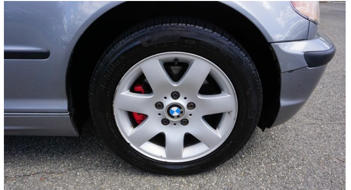
Right Side Front Wheel and Rim (straight view - not angled)