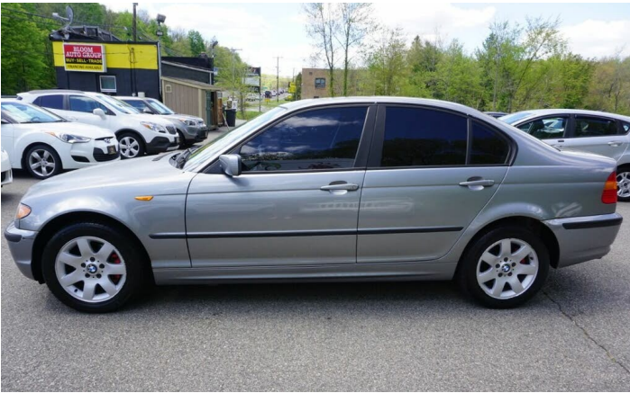
Front left side