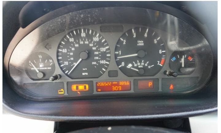
Odometer Reading (engine on)