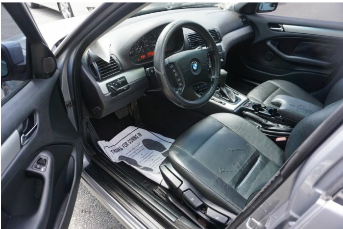
Front Seats (From driver door)