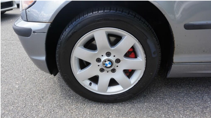
Left Side Front Wheel and Rim (straight view - not angled)