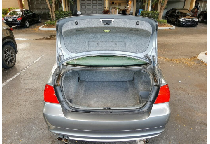
Trunk open/Truck Bed