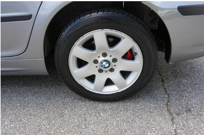
Left Side Rear Wheel and Rim (straight view - not angled)