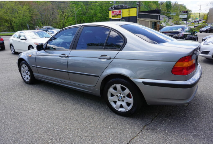
Rear left side