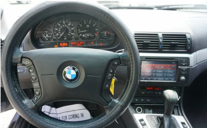
Dashboard (engine on)