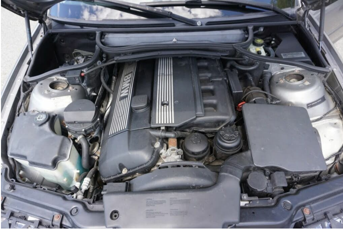
Engine (hood open)