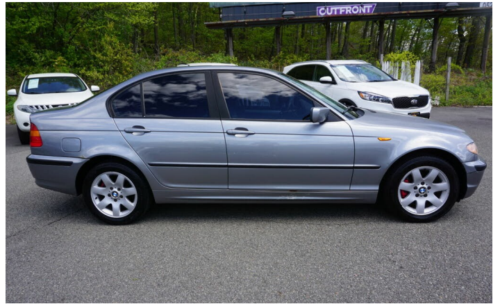
Front right side